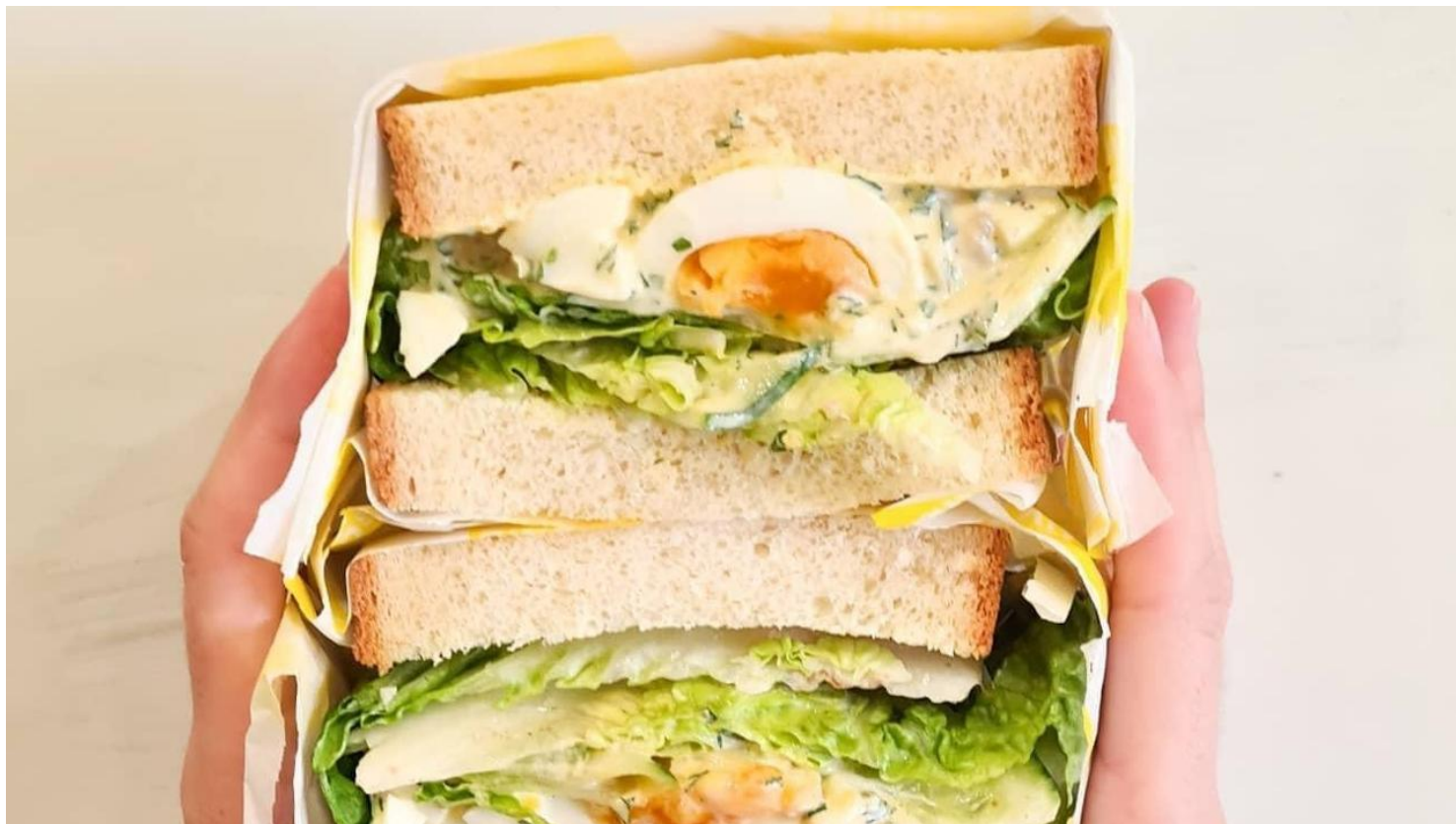
An egg sandwich at Sunny Side Sandwiches.