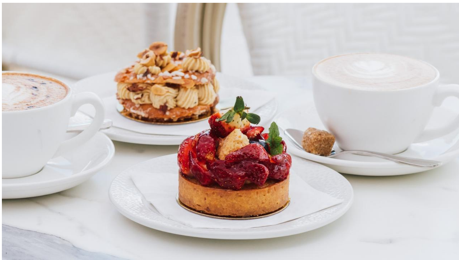
Patisserie from Rise Bakery.