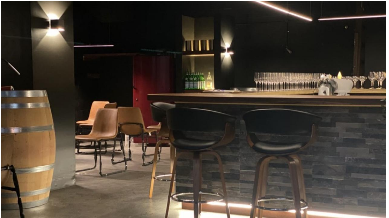
D.Vino wine bar and bistro in Woolloongabba.